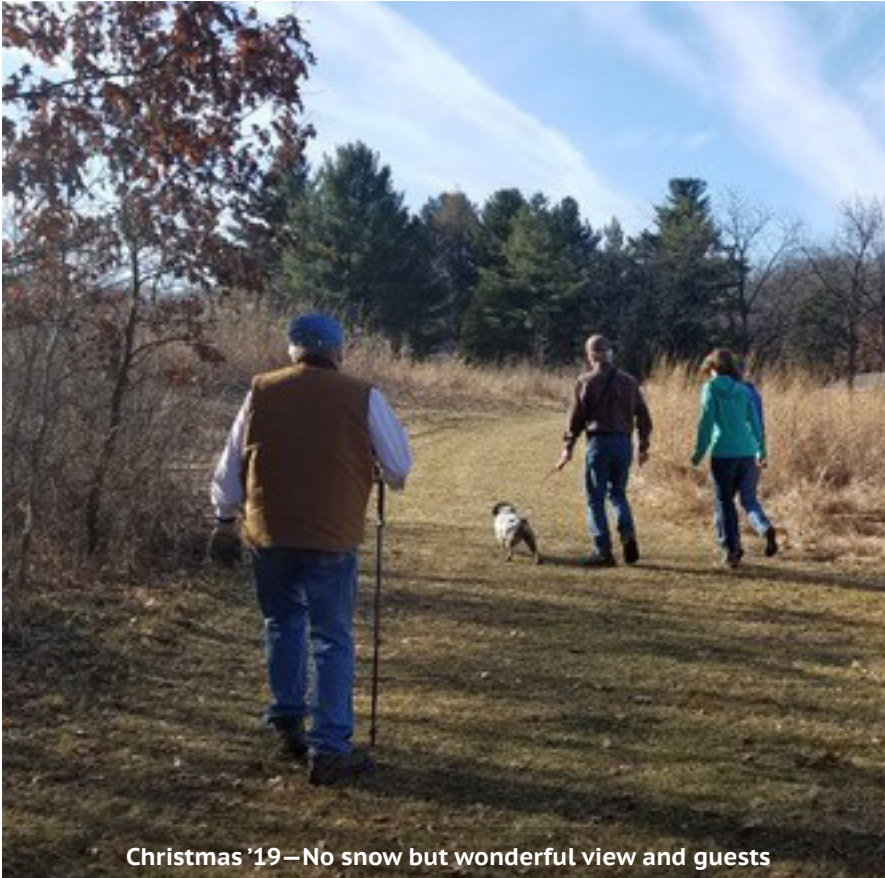
Christmas '19—No snow but wonderful view and guests